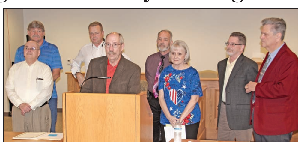
Several pastors from the area attended the {f April} county commission meeting, to offer a preview of the upcoming National Day of Prayer on Thursday, May 4.